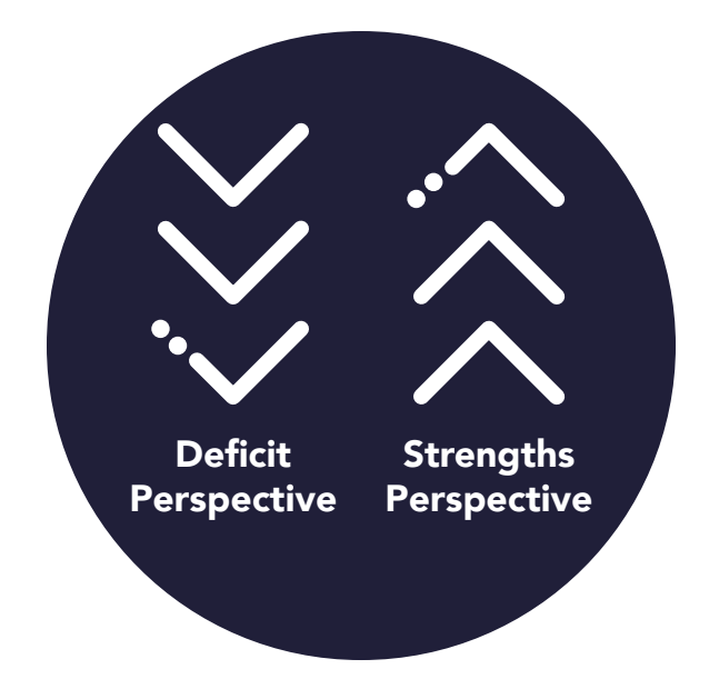
Figure 2. Deficit-Oriented Versus Strengths-Based Approaches Khasnabis and Goldin (2020):

Khasnabis and Goldin (2020) call on school professionals to remain mindful of the ways in which their language and behavior can reinforce the deficit model. They contend that students are far better served by a model based in strengths and assets, which aligns with content in TIPP 7 regarding the importance of high expectations. Focusing on students' existing abilities—and, in turn, how they can use those abilities to facilitate their achievement—assists students in building confidence, feeling motivated, and thinking of school as a positive environment (Figure 2).