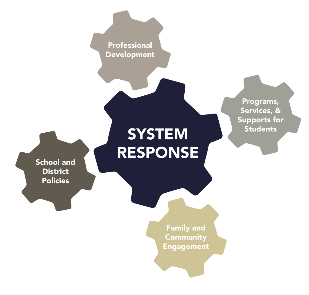
Figure 1: System Response to Trauma

Viewing trauma as a system issue requiring a system response helps to position schools to act collectively and contribute to the betterment of the whole school community. School systems are shaped by interacting policies and practices, including school and district policies, programming for students, family and community engagement, and professional development for school personnel, that together can shape student experience (Figure 1).